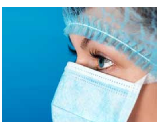
Unifor wins mediation with the Ontario government to provide all front line health care workers with appropriate PPE.