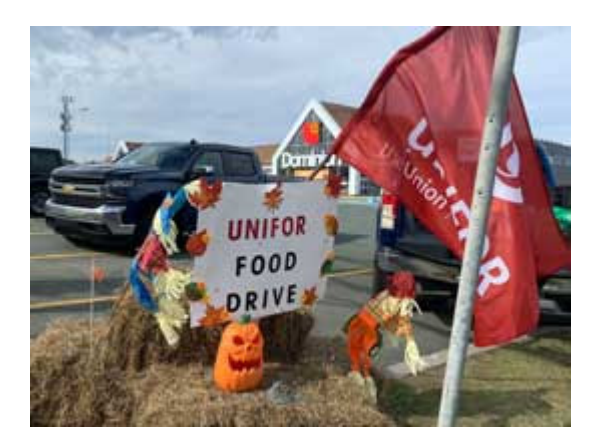
Striking Dominion grocery workers hold a Thanksgiving food drive to address food insecurity in their communities.