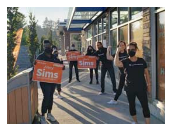
Unifor members in British Columbia and Saskatchewan have begun mobilization efforts in two provincial elections.

Ontario government announces COVID Emergency Wage Enhancement for PSWs but we need all front-line health care workers be included.