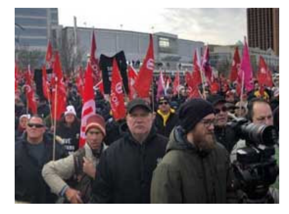
An independent documentary about the fight to save the General Motors assembly plant and thousands of jobs airs on CBC television Saturday.