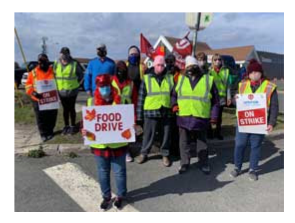
Unifor 597 Dominion workers accept donations to aid local food banks and messages of support from the public during food drive at 11 picket line locations across Newfoundland.